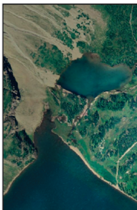
High-Resolution Color Aerial Imagery