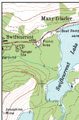
USGS 7.5-Minute Topographic Quad Maps

Provides users of both Earthmate PN-Series GPS receivers and Topo USA software with a full year's worth of unlimited access to the online DeLorme Map Library, for easy downloads of the following: